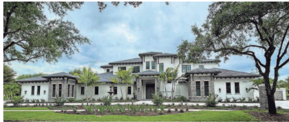
The St. Lawrence in Quail West. FORTMYERS

A private study is right off the master suite, bordering the expansive great-room and formal dining area. Also on the first floor is 2 additional bedrooms, a chef's kitchen and pantry, casual dining area and a family room. The second story contains 3 extra bedrooms with 2 balconies, an additional utility room and a multipurpose room. The St. Lawrence also offers a large outdoor living area with a pool and spa, 2 lanais and a summer kitchen. To see photos and floorplans of the luxurious St. Lawrence, please visit Florida Lifestyle Homes online at FLHFL.com